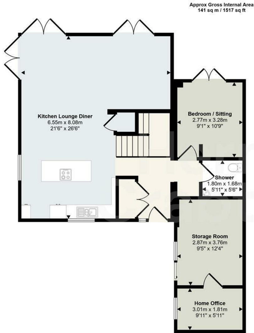
Ground Floor Approx 87 sq m / 938 sq ft